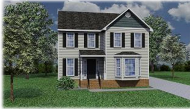
Elevation A (Shown w/ Optional Bay Window)

ADDITIONAL ELEVATIONS SHOWN W/ SHAKE, BOARD AND BATTEN, AND/OR ARCHITECTURAL GABLE ACCENTS